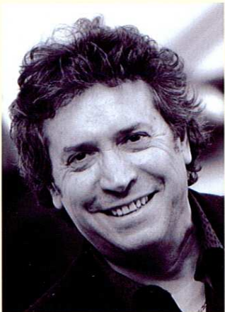
Franco Dragone Founder & Artistic Director Franco Dragone Entertainment Group

佛朗哥·德拉戈擅长于创编各种晚会,曾在太阳马戏团工作超过12年,创编过十多部大戏,包括极为成功的《阿里格利亚》、《蔡丹》、《萨尔廷班科》、《神秘》、大型水剧《O》及《魔动之旅》等作品。这些作品至今仍深受观众热捧,经久不衰。