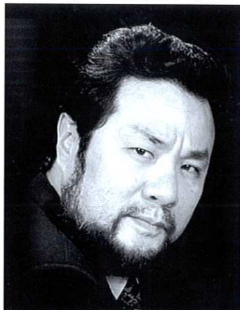
Mr. Chen Weiya Deputy Director, Artistic Director, State A-Level Director China National Song and Dance Ensemble

中国当代著名编导家。中国东方歌舞团 (国家歌舞团) 艺术总监、副团长。中国舞蹈家协会副主席。北京舞蹈家协会主席。《大梦敦煌》、《恨海晴天圆明园》、《周旋》等多部舞剧的总导演；与张艺谋共同执导歌剧《图兰朵》；大型杂技剧《西游记》总导演；第 21 届世界大学生运动会开幕式、第十届全国运动会开幕式、文化部 1997、1998、1999、2004 年春节电视文艺晚会、建国 50 周年大型文艺晚会总导演；2008 年北京奥运会开闭幕式副总导演及执行总导演；2009 年香港东亚运动会开幕式、2010 年广州亚运会开闭幕式总导演；国务院专家特殊津贴获得者。中宣部“四个一批”人才之一。全国“百名优秀文艺家”之一。04 中国“十大艺术英才”之一。北京市“德艺双馨”称号获得者。美国“亚洲文化协会”学者奖金获得者。是我国目前执导大型开幕式文艺活动最多、成功率最高的总导演。