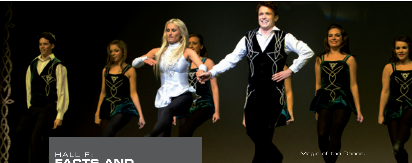
Magic of the Dance.