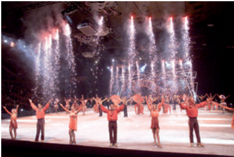
Holiday on Ice.