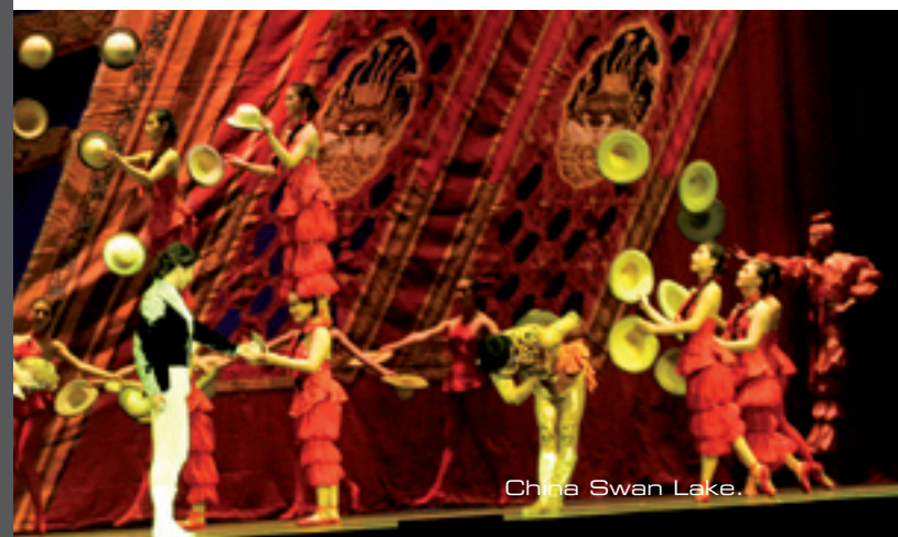
China Swan Lake.

Total area Total effective area: 13,660 m 2 , Base area: 4,885 m 2 , Main foyer with cloakrooms: 1,300 m 2 2 Intermission foyers: each 400 m 2 Banquet hall: 300 m 2