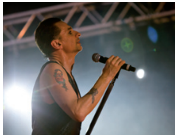
Kylie Minogue (left), Bryan Adams, Tina Turner, Depeche Mode.