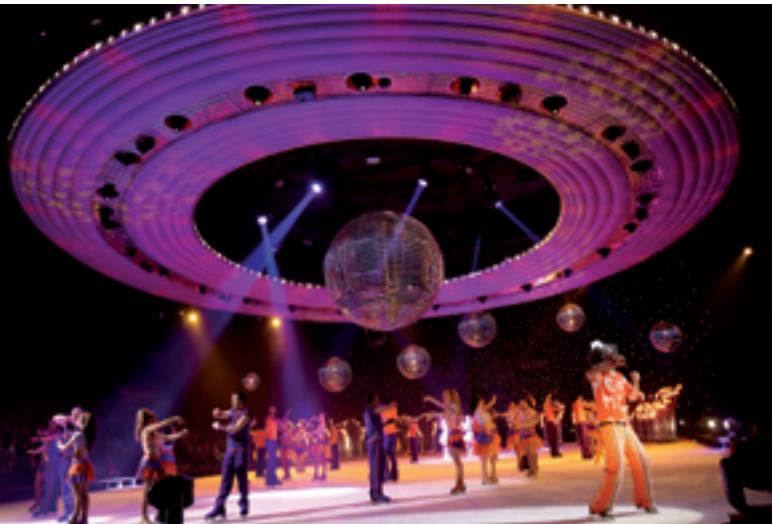
Holiday on Ice "Energia".