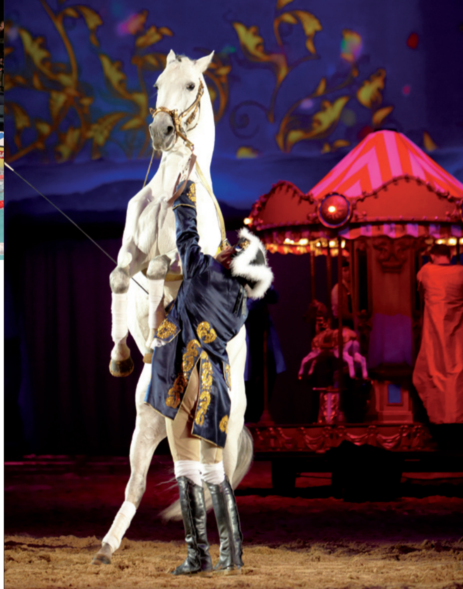
A Passionata. Beautiful horses and skilled riders in perfect harmony.

"Vienna Sports Festival" and indoor soccer matches hold thousands of visitors spellbound. The tennis, soccer and horse riding tournaments offer an outstanding platform for sponsoring and VIP hospitality.