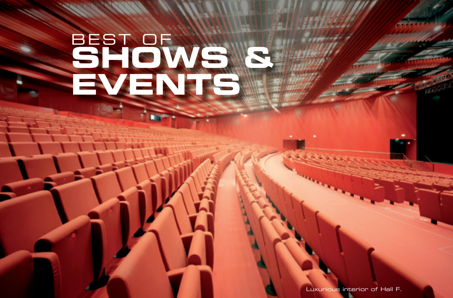
Luxurious interior of Hall F.