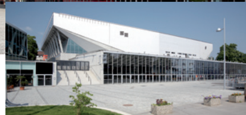
Hall F (above) and Hall D (left).

100 meters on each side, which immediately identifies this iconic building; this intriguing roof shape is the inspiration for the corporate logo.