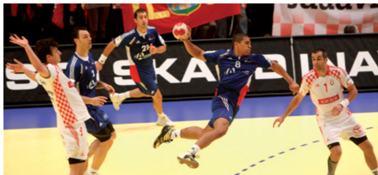
European Swimming Championships (above), European Handball Championships 2010.